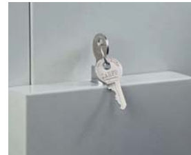
Push - button key lock