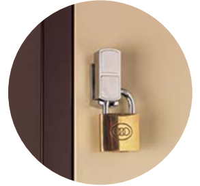
Latch lock for pad-locking