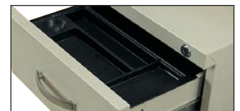
Unit equipped with stationery tray and hanging rails for side to side filing