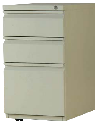
Box/Box/File - YMI 6612 695 (H) x 381 (W) x 560 (D) mm