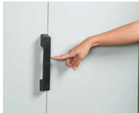
Quiet and effortless movement