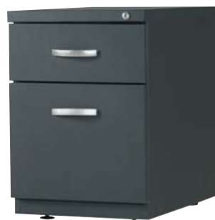
Box/File - YMI 6212 545 (H) x 381 (W) x 560 (D) mm