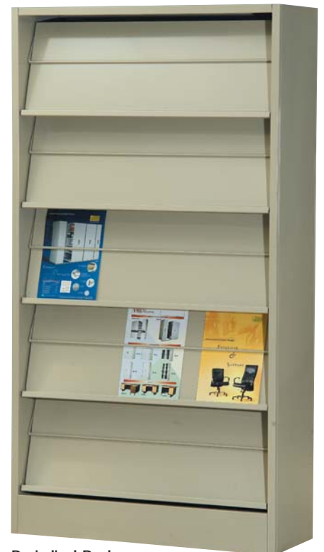
Periodical Rack c/w 5 nos Pull-out Sloping Shelves & 5 nos. Storage Compartments - YMI 5A 1655 (H) x 1010 (W) x 340 (D) mm