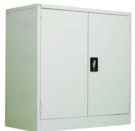
Steel Swing Door with 1 adjustable shelf - YMI 203 914 (H) x 914 (W) x 457 (D) mm