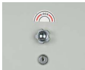
Central & safety lock with visual indicator