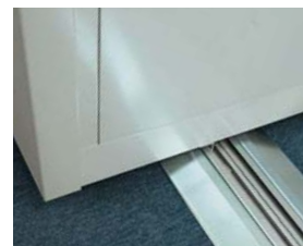
Tapered track cover