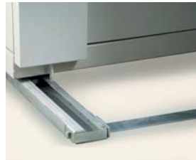
Specially designed and well-constructed zinc plated track for durability and smooth operation