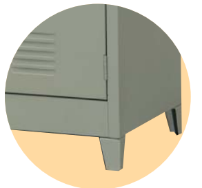
Optional pedestal legs