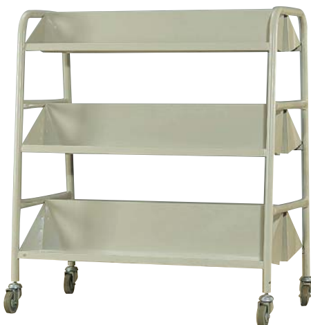
Book Trolley (Double Side) - YMI 382 500 (D) x 915 (W) x 1037 (H) mm