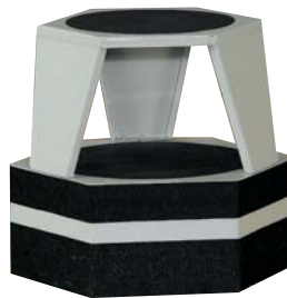
Kick Step Stool - YMI 381 325 (D) x 365 (H) mm