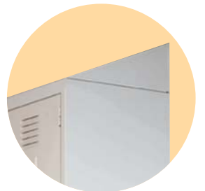
Optional sloping top