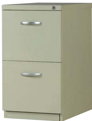
File/File - YMI 1212 695 (H) x 381 (W) x 560 (D) mm

YMI mobile pedestals, lateral files and mobile filing cabinet are part of YMI compact office storage system that compliment most office open-plan partitions and stand-alone office furniture system.