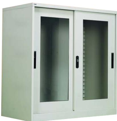
Glass Sliding Door with 1 adjustable shelf - YMI 201 914 (H) x 914 (W) x 457 (D) mm