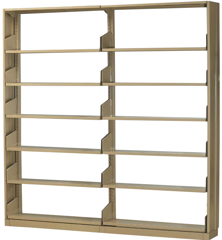
Single Side c/w 6pcs Shelves & 1pc Top Panal - YMI 372W (1) End Bay 1980 (H) x 1000 (W) x 280 (D) mm Extension Bay 1980 (H) x 950 (W) x 280 (D) mm