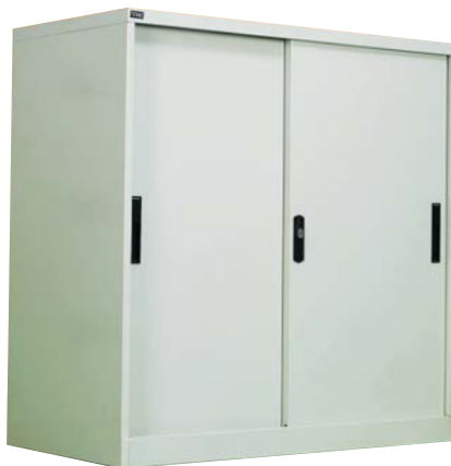
Steel Sliding Door with 1 adjustable shelf - YMI 202 914 (H) x 914 (W) x 457 (D) mm