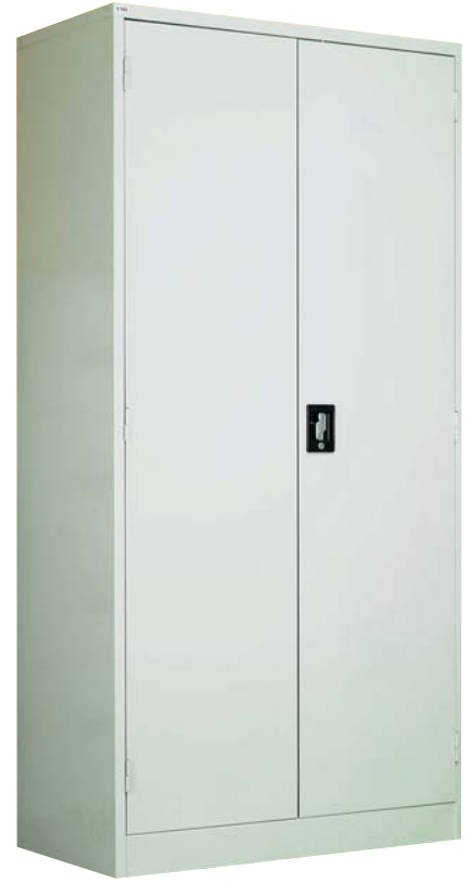
Steel Swing Door with 3 adjustable shelves - YMI 204 1829 (H) x 914 (W) x 457 (D) mm