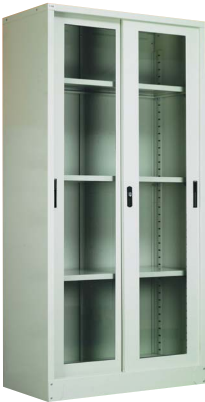
Glass Sliding Door with 3 adjustable shelves - YMI 206 1829 (H) x 914 (W) x 457 (D) mm