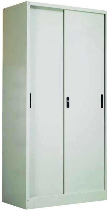
Steel Sliding Door with 3 adjustable shelves - YMI 205 1829 (H) x 914 (W) x 457 (D) mm