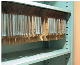
Suitable for hanging files and storing arch files