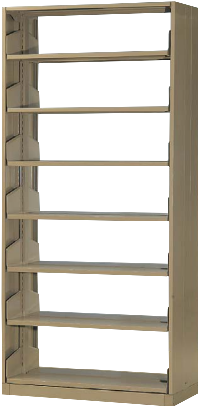
Single Side c/w 7pcs Shelves & 1pc Top Panal - YMI 373W (1) End Bay 2150 (H) x 1000 (W) x 280 (D) mm Extension Bay 2150 (H) x 950 (W) x 280 (D) mm